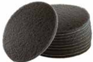
UNEELON SANDING PADS & DISCS